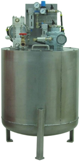
picture: spray medium container 50 litres with pneumatic agitator