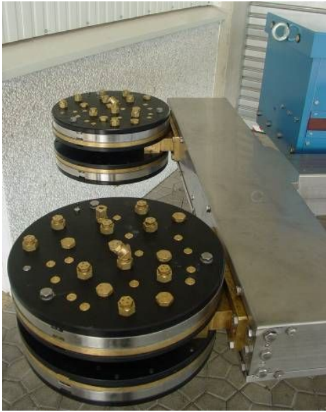
4-circuit custom designed sprayheads for steering knuckle

for 2 spray medium media 1: water-graphite media 2: water